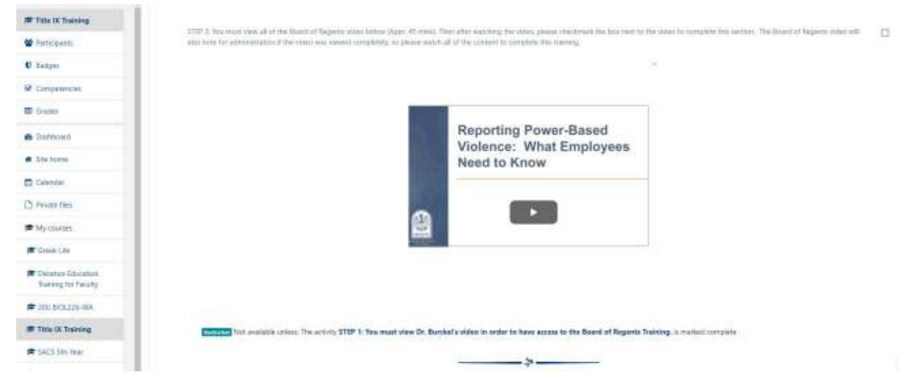
The training includes the training module provided by the Board of Regents.